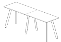
Tall Table 2pc top ( 750 "SPLAY" 1000mmH leg )

2800 x 800-1100 3000 x 800-1100 3200 x 800-1100 3600 x 800-1100 4200 x 800-1100