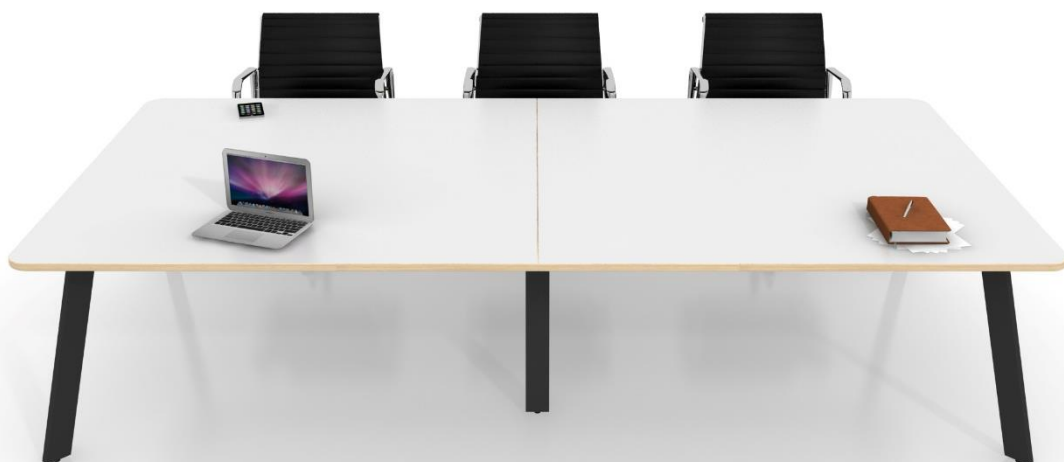
Gen X2 Model: X2-MT2-1200 Meeting tables with 2 pc top on 1200 end legs and recessed shared leg