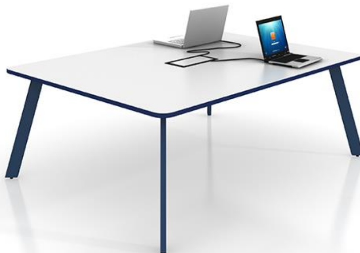
Gen X2 Model: X2-MT1-1200 Meeting tables with 1 pc top on 1200 end legs